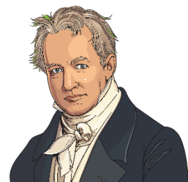
Wilhelm von Humboldt

Language is "the infinite use of finite means".